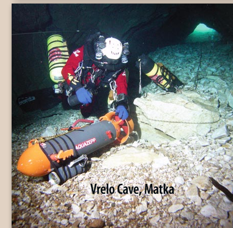
Vrelo Cave, Matka

JPCCommittee - News from the Assembly of the Republic of Macedonia, No. 6 - June 2010