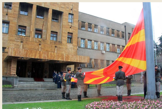
Day of the Macedonian flag